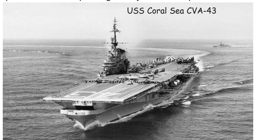
USS Coral Sea CVA-43