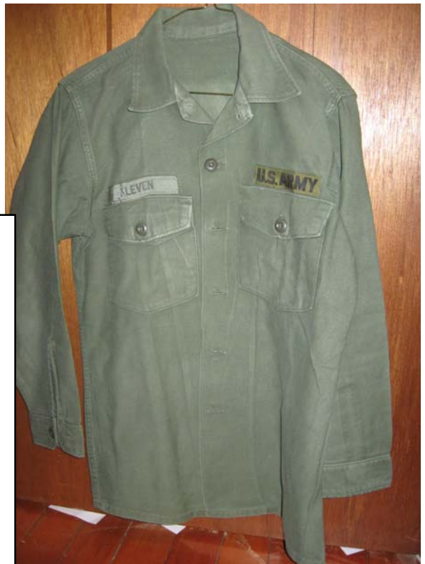
Class A dress Uniform (left) and Standard Issue fatigue shirt worn by Dan Klevan, donated 2008