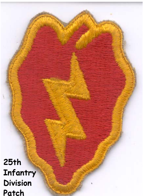
25th Infantry Division Patch

The Division Headquarters for the 25th was located about 35 miles south of Saigon, near Cu Chi Vietnam. He traveled there by bus. He was assigned to the 3rd Platoon, 2nd Battalion, 12 Infantry Regiment stationed at Fire Support Base Pershing, 30 miles north (18 km) of Cu Chi. He took a helicopter flight to FSB Pershing. This was about half way between the Red China Sea, and the Cambodian boarder.