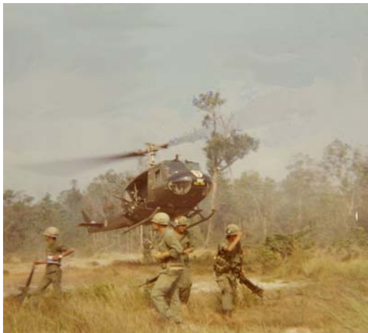
Above, Huey helicopter coming in, below is a view of Vietnam from the air.