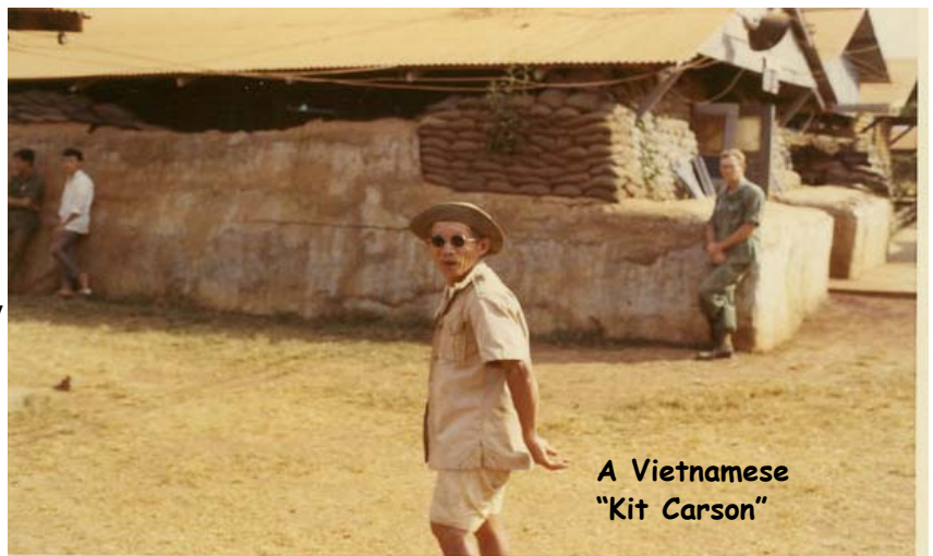
A Vietnamese "Kit Carson"