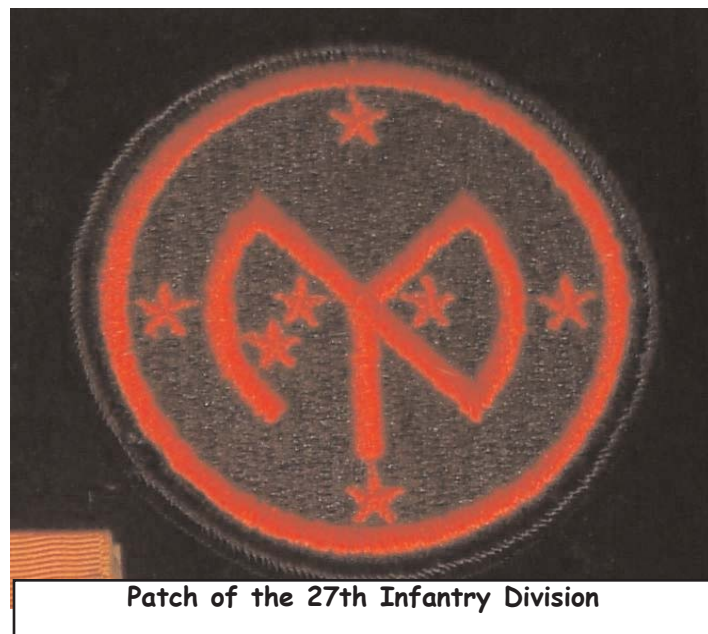
Patch of the 27th Infantry Division

They did Jungle training, and tried to become climatized for the tropical environments that they would be fighting in. Clarence also recalled the amphibious assault training that they did on the north side of the island.